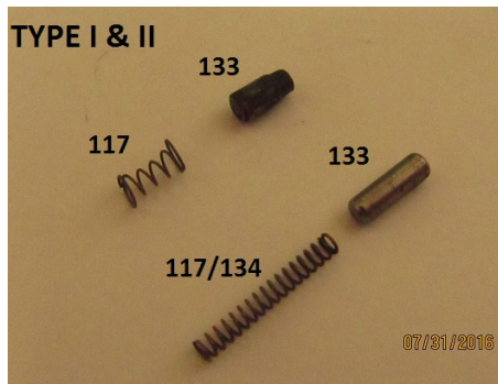
Perazzi's nomenclature changed from the early years design and that is why the part numbers 117 and 134 appear to differ.

Both have a release pin located at 12 o'clock in the receivers face. There are two distinct versions of this design: